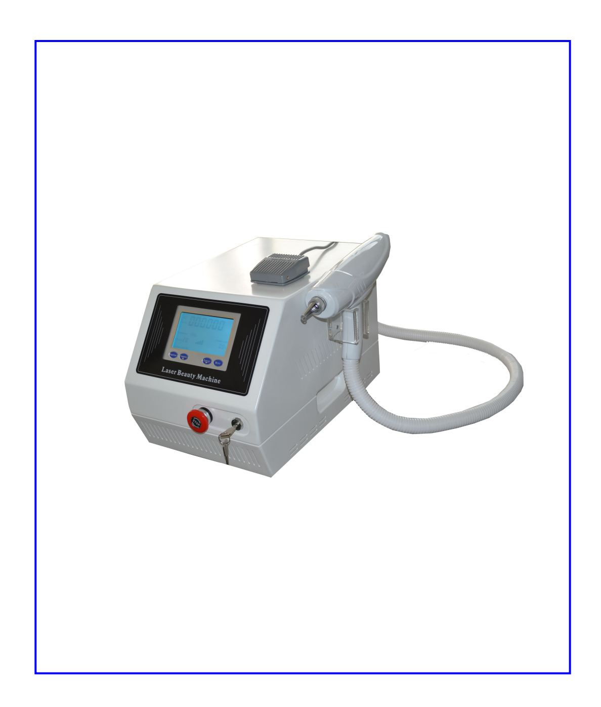
LN-T200 yag laser tattoo removal machine

-Please read the instructions before use!