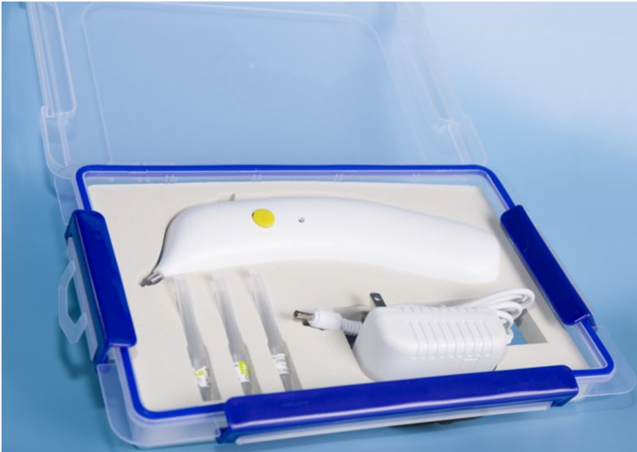
Micor point mole freckle removal pen