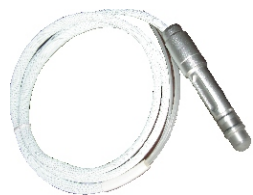
Sand dermabrasion handle