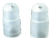
Crystal dermabrasion cap