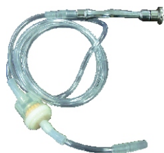
Diamond dermabrasion rod