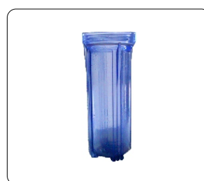
Wastewater recycling bottle