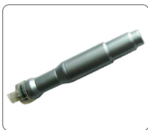
Vacuum Spa handle